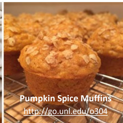
Pumpkin Spice Muffins http://go.unl.edu/o304