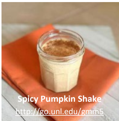
Spicy Pumpkin Shake http://go.unl.edu/gmm5