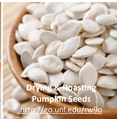
Drying & Roasting Pumpkin Seeds http://go.unl.edu/rw9o